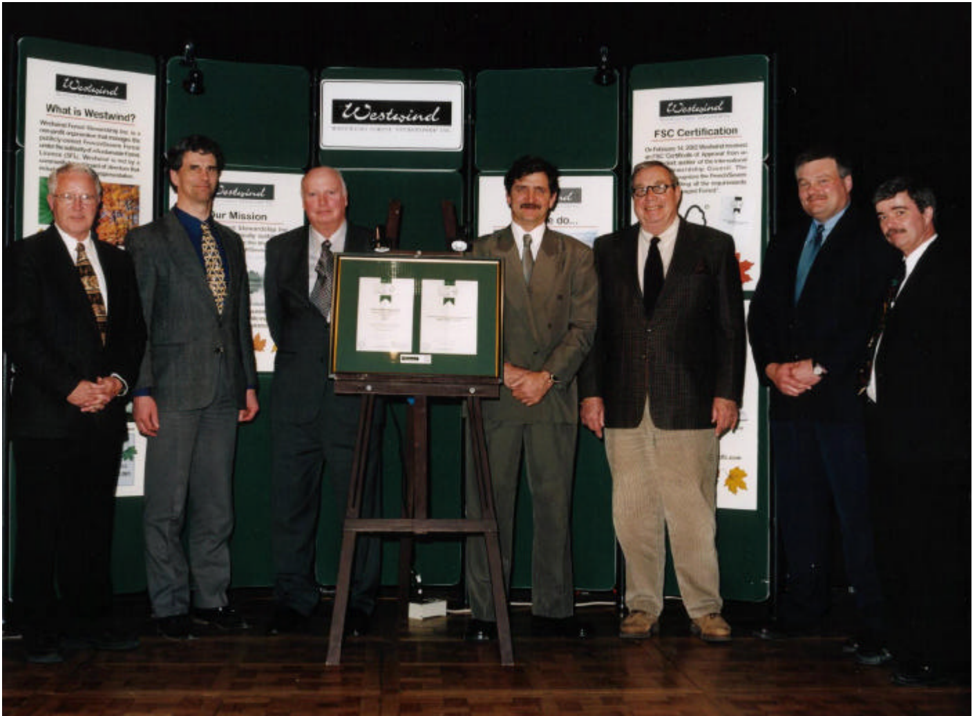
Westwind's Board of Directors at the FSC Certificate Spring 2002.